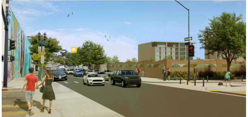
This graphic serves as an illustration to depict the anticipated appearance of the finished substation

Our commitment to providing safe and reliable energy means making improvements to our system, which includes rebuilding and upgrading the existing Urban Substation. This project will replace aging electric service equipment and improve the safety and reliability of electric transmission and distribution systems for the downtown San Diego area.